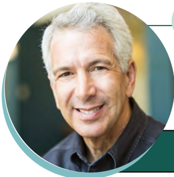
Fred Krupp President of EDF

“ The task of controlling methane and other non-carbon dioxide gases in China is not easy and cannot be achieved overnight. It requires long-term arduous efforts, ... We are willing to act, but we still lack the capabilities, and we need to continue to work hard and strengthen this area through international cooperation. ”