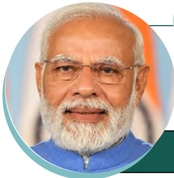
Narendra Modi Prime Minister, India

There is no magic elixir here. You can't wave a wand and make it all happen. You need to fight for those things we can make happen. And I think that in Dubai we did a pretty damn good job of pulling together the best opportunities.