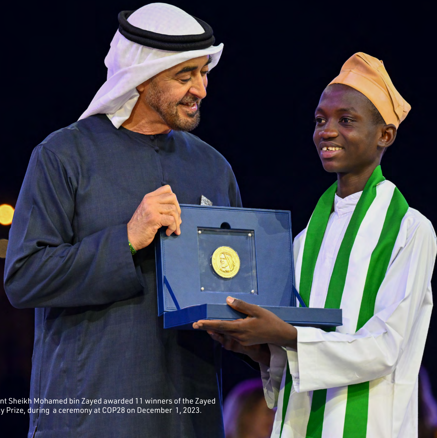
UAE President Sheikh Mohamed bin Zayed awarded 11 winners of the Zayed Sustainability Prize, during a ceremony at COP28 on December 1, 2023.