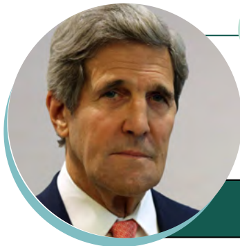
John Kerry United States Special Presidential Envoy for Climate

I want to salute the UAE for establishment of the ALTERRA fund, 30 bil to scale to 250 bil. private sector funds are going to be critical.