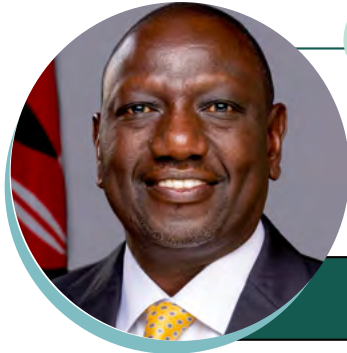
William Ruto President of Kenya

“ At the heart of our discussions at this COP28 must be a package of ambitious energy transition and investment goals and incentives, ... The strong participation of traditional hydrocarbon energy leaders .. has transformed the conversation and brought us closer to consensus based on democratic inclusion and the best spirit of collective action, as well as multilateralism. ”