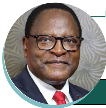
Dr. Tedros Adhanom Ghebreyesus Director-General, World Health Organization

“ Climate change is increasingly impacting the health and wellbeing of our community. This year, at COP28, we are calling for a bolder path forward that prioritizes investments in health and wellbeing, ensures a just transition away from fossil fuels, and creates a healthier future for all of us. ”