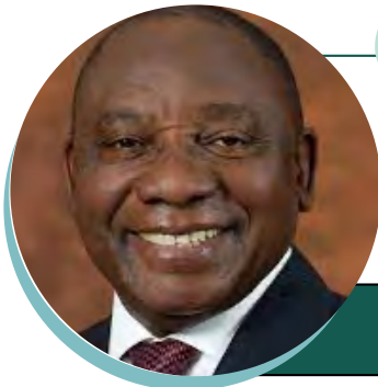
Cyril Ramaphosa President of South Africa

Within 20 minutes of your Presidency, you have not only operationalized the [Loss and Damage] fund but also capitalized it by getting pledges. [This is] unprecedented and shows the COP Presidency means business!