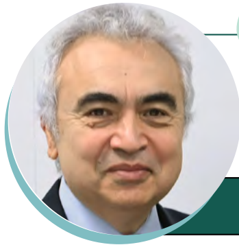
Fatih Birol Executive Director, International Energy Agency

I congratulate the COP28 Presidency & countries for this major outcome that clearly states the goal of transitioning away from fossil fuels in line with 1.5°C. Pleased to see most IEA pillars reflected, though greater efforts are needed on finance for developing economies.