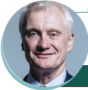
Graham Stuart MP Minister of State for Energy Security and Net Zero, UK

Establishing a fund to deal with loss and damage was long overdue - the UK was pleased to contribute to that fund...This is the beginning of the end of the fossil fuel era...[the world has united] around common commitments to move away from fossil fuels....This outcome is something we can genuinely celebrate.