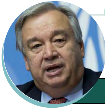
Antonio Guterres Secretary General, United Nations

"We need to bridge the gap between the global north and the global south. And those who promise, must deliver. Those who pledge, must act." I am determined to do everything in my power to restore faith and confidence in multilateralism. I will hold every state, every party and every stakeholder accountable for keeping 1.5 in reach.