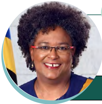
Mia Mottley Prime Minister, Barbados

I want to salute the UAE for establishment of the ALTERRA fund, 30 bil to scale to 250 bil. private sector funds are going to be critical.