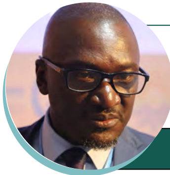
Collins Nzovu MP , Minister of Green Economy and Environment, Chair of the Africa Group

Establishing a fund to deal with loss and damage was long overdue - the UK was pleased to contribute to that fund...This is the beginning of the end of the fossil fuel era...[the world has united] around common commitments to move away from fossil fuels....This outcome is something we can genuinely celebrate.