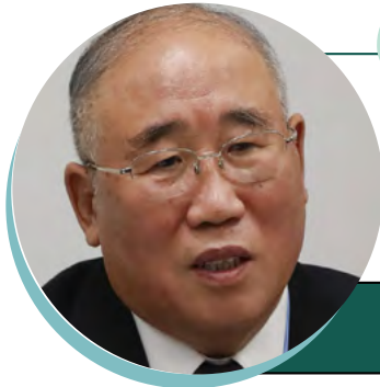
Xie Zhenhua China Special Envoy for Climate Change

“ At the heart of our discussions at this COP28 must be a package of ambitious energy transition and investment goals and incentives, ... The strong participation of traditional hydrocarbon energy leaders .. has transformed the conversation and brought us closer to consensus based on democratic inclusion and the best spirit of collective action, as well as multilateralism. ”