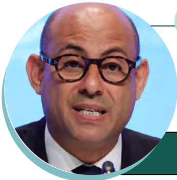
Simon Stiell Executive Secretary, UNFCCC

"COP28 occurred at a decisive moment in the fight against climate change...it's important that the outcome of the Global Stocktake clearly reaffirms the need for limiting global temperature rise to 1.5°C & that this requires drastic reductions in emissions in this decade...for the first time, there is a recognition of the need to transition away from fossil fuels _after many years in which the discussion of this issue was blocked.