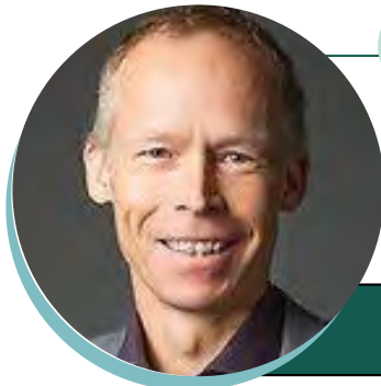
Johan Rockström Director of the Potsdam Institute for Climate Impact Research

We have made an incremental advancement over business as usual when what we really needed is an exponential step change in our actions and support.