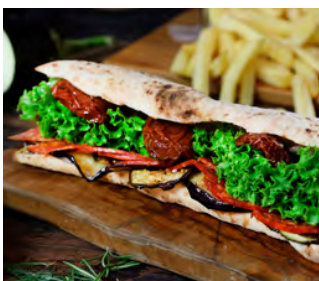
SPIANATA & MOZZARELLA