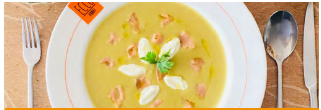
VELLUTATA DI ASPARAGI