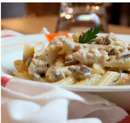
PENNE ALFREDO WITH CHICKEN