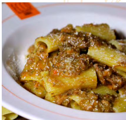
GENOVESE DI CORAZZA