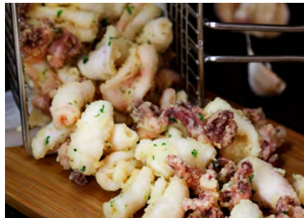
FRITTURA DI CALAMARI