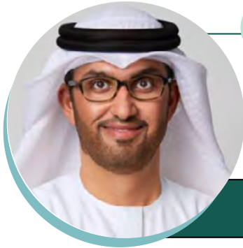
Dr. Sultan Al Jaber COP28 President

“ We need to bridge the gap between the global north and the global south. And those who promise, must deliver. Those who pledge, must act.” I am determined to do everything in my power to restore faith and confidence in multilateralism. I will hold every state, every party and every stakeholder accountable for keeping 1.5 in reach. ”