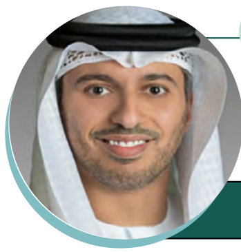
H.E. Dr. Ahmad Belhoul Al Falasi Minister of Education

The UAE has become the birthplace of the role of the first ever COP Youth Climate Champion, carrying forward the nation's rich legacy in empowering youth to a global level. We have delivered transformative change that will stand as a lasting legacy for future COPs.