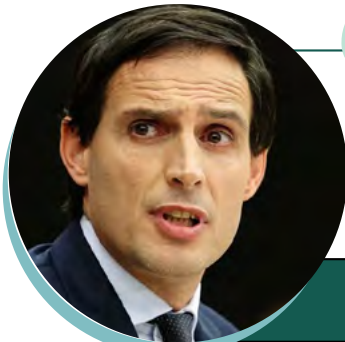
Wopke Hoekstra European Union Commissioner for Climate Action

This COP will mark the beginning of the end of fossil fuels. The text we have in front of us sets in motion an irreversible, and accelerated transition away from fossil fuels. Humanity has finally done what is long, long, long overdue.