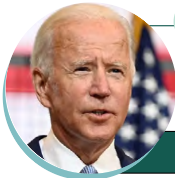
Joe Biden President of USA

This COP will mark the beginning of the end of fossil fuels. The text we have in front of us sets in motion an irreversible, and accelerated transition away from fossil fuels. Humanity has finally done what is long, long, long overdue.