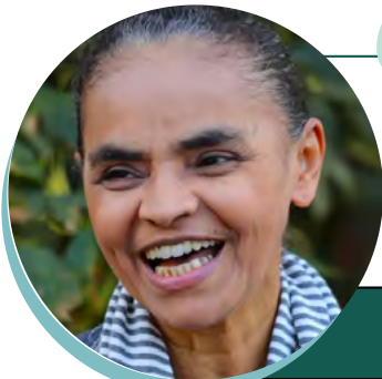
Marina Silva Minister for Environment & Climate Change, Brazil

Today, at COP28, world leaders reached another historic milestone _ committing, for the first time, to transition away from the fossil fuels that jeopardize our planet and our people, agreeing to triple renewable energy globally by 2030, and more. While there is still substantial work ahead of us to keep the 1.5 degree C goal within reach, today's outcome puts us one significant step closer.