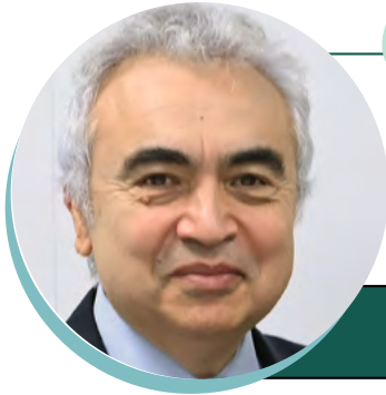
Fatih Birol Executive Director, International Energy Agency

I congratulate the COP28 Presidency & countries for this major outcome that clearly states the goal of transitioning away from fossil fuels in line with 1.5°C. Pleased to see most IEA pillars reflected, though greater efforts are needed on finance for developing economies.