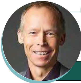
Johan Rockström Director of the Potsdam Institute for Climate Impact Research

We have made an incremental advancement over business as usual when what we really needed is an exponential step change in our actions and support.