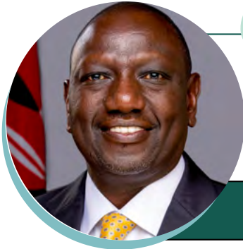
William Ruto President of Kenya

“ At the heart of our discussions at this COP28 must be a package of ambitious energy transition and investment goals and incentives, ... The strong participation of traditional hydrocarbon energy leaders .. has transformed the conversation and brought us closer to consensus based on democratic inclusion and the best spirit of collective action, as well as multilateralism. ”