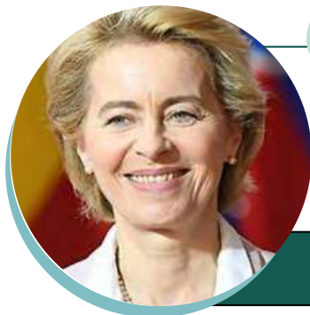
Ursula von der Leyen President of the European Commission

“ We must roll out more renewables, and we must use less energy to produce the products and services we need... This is the reason why, eight months ago, we launched the idea of global targets on renewable energy and energy efficiency. It looked like a long shot, an almost impossible gamble. But we all believed that we had to give it a try. And actually, the result is amazing. ”