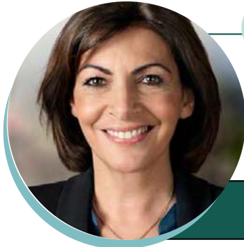
Anne Hidalgo Mayor of Paris, France

Allow me to thank the Secretary General of the United Nations, and the President of COP28, and Mike Bloomberg, because mayors need commitment at this level. If you want to achieve the Paris Agreement targets, we need to have cities in the room. What happened today is a major success. And to all of my colleagues, let's make sure mayors remain in the room.