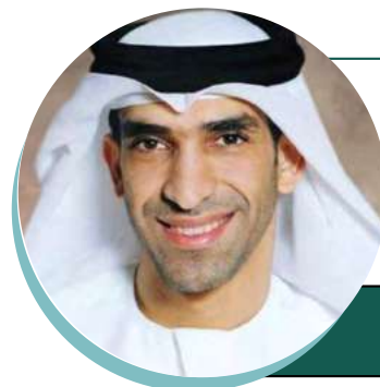
HE Dr Thani Al Zeyoudi UAE Minister of State for Foreign Trade

We want to demonstrate that trade is part of the solution to the climate crisis. We will bring to the table a menu of trade policy actions that could help countries reach net zero.