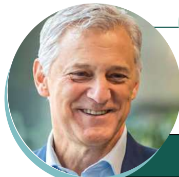
Bill Winters Group Chief Executive, Standard Chartered Bank

In order to accelerate climate solutions at the pace and scale required, we must transition from voluntary climate action, to standards, regulations and policies that will level the playing field, create the right incentives, and enable all actors of the economy to engage in a just transition to halve emission by 2030 and which supports the Sustainable Development Goals.