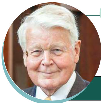
HE Ólafur Ragnar Grímsson Chairman of Arctic Circle (Former President of Iceland)

The science has spoken. It has confirmed that the moment is now to find a new road. A road wide enough for all of us, free of the obstacles and detours of the past. That new road starts with a decision on the Global Stocktake, a decision that corrects course and accelerates action to 2030.