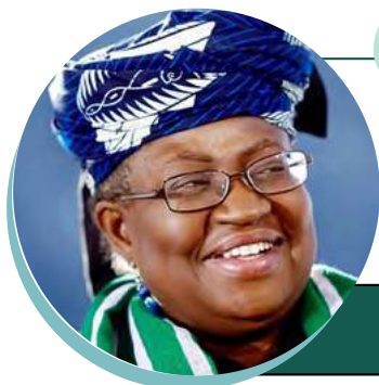
Ngozi Okonjo-Iweala Director-General of the World Trade Organization

Putting trade on the COP agenda for the first time is a big step forward towards ensuring international commerce can be better leveraged to support global climate goals.