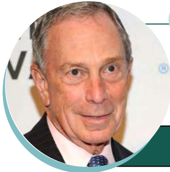
Mike Bloomberg , UN Special Envoy on Climate Ambition and Solutions and founder of Bloomberg LP and Bloomberg Philanthropies

Allow me to thank the Secretary General of the United Nations, and the President of COP28, and Mike Bloomberg, because mayors need commitment at this level. If you want to achieve the Paris Agreement targets, we need to have cities in the room. What happened today is a major success. And to all of my colleagues, let's make sure mayors remain in the room.