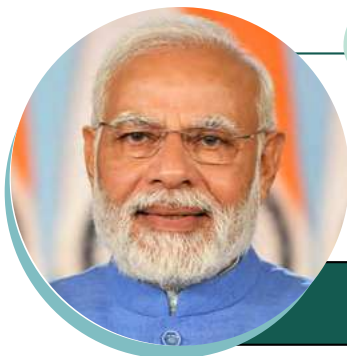
Narendra Modi Prime Minister, India

There is consensus in the G20 that by 2030 several trillions will be needed for climate action. Climate finance that is available, accessible, and affordable. I am hopeful that UAE's climate finance framework initiative will strengthen efforts towards this.