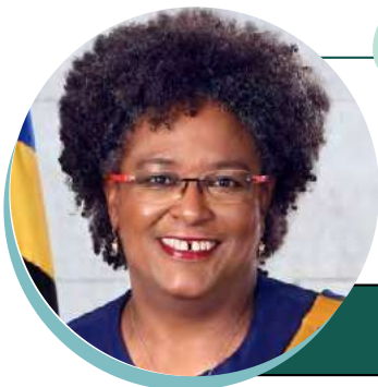
Mia Mottley Prime Minister, Barbados

COP28 is reshaping the investability narrative of Africa's green industrialization and helping forge a green pathway for Africa via breakthrough initiatives such as the African Investment Leaders Earthshot Summit.