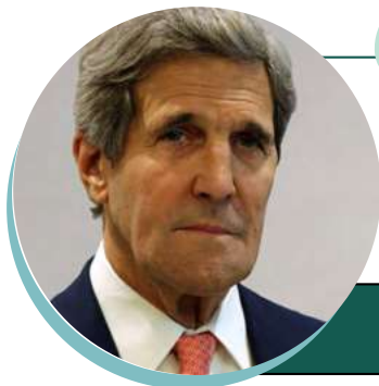
John Kerry United States Special Presidential Envoy for Climate

It's absolutely essential that we deal with methane.