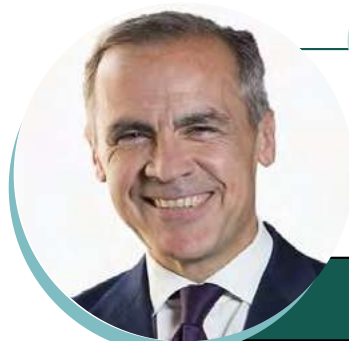
Mark Carney , UN Secretary-General's Special Envoy on Climate Action and GFANZ Co-Chair

“ At the heart of our discussions at this COP28 must be a package of ambitious energy transition and investment goals and incentives, aligned with our commitment to maintaining global temperatures within a 1.5°C limit. This entails a pledge to triple renewable energy capacity, and double energy efficiency by 2030, alongside a significant reduction in fossil fuel dependency. I commend the COP Presidency for their efforts to converge the world around this global goal. ”