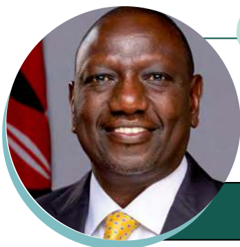
William Ruto President of Kenya

“ We must roll out more renewables, and we must use less energy to produce the products and services we need... This is the reason why, eight months ago, we launched the idea of global targets on renewable energy and energy efficiency. It looked like a long shot, an almost impossible gamble. But we all believed that we had to give it a try. And actually, the result is amazing. ”