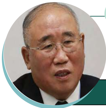
Xie Zhenhua China Special Envoy for Climate Change

It's absolutely essential that we deal with methane.