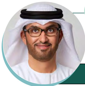
Dr Sultan Al Jaber COP28 President

The science has spoken. It has confirmed that the moment is now to find a new road. A road wide enough for all of us, free of the obstacles and detours of the past. That new road starts with a decision on the Global Stocktake, a decision that corrects course and accelerates action to 2030.